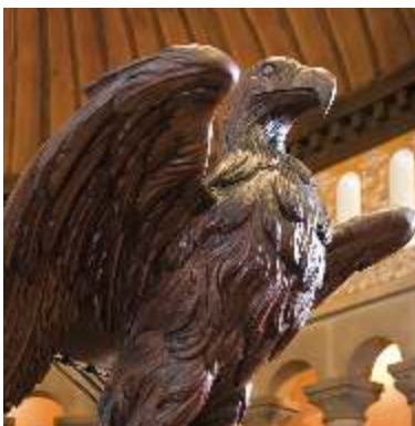
BAT, BUTTERFLY, COCK, DOVE, DRAGON, DRAGONFLY, EAGLE, LAMB, OWL, STORK

As you walk around look out for animals and find 10 of them in this word square.